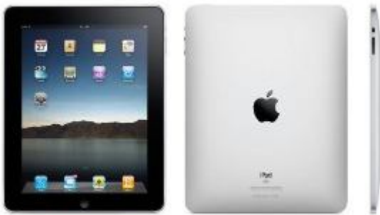
'Best Short Paper' Prize: Apple iPad

OIA are proud to sponsor this 'Free Paper' competition. We would like to attract photographers/imagers to present a short (up to 10 minutes) case presentation. 'Best Short Paper' prize is the wonderful Apple iPad.