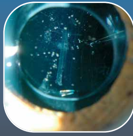
Best Anterior Segment Image by Abi Loose