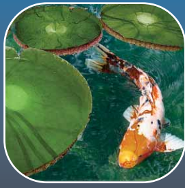
Best Artistic Image by Jon Brett